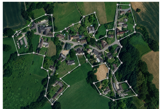
Figure 2 2.0 km fibre ring serving individual properties around Gittisham.